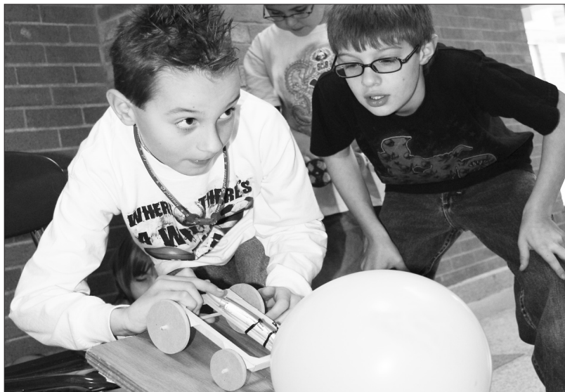
Students at Tamarac Elementary School won't soon forget the difference between potential and kinetic energy. Students this year created wooden cars for a science project that taught them about different forms of energy.

I have been a resident of the town of Brunswick for 19 years and have served on the School Board for the past three. My wife is a long-time resident of the district and we have a daughter in the elementary school. I retired from UPS after 34 years as a manager. I enjoy being part of the process of helping children and families. I am open to all thoughts and opinions and bring a strong background in operations. I am very community and family oriented and ask for your support to serve this community for another three years.