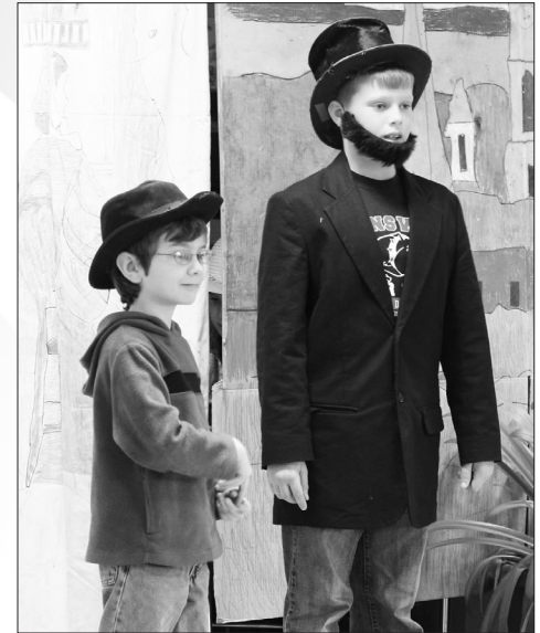
Fifth graders recreate the Lincoln-Douglas debates during a Civil War play. Students researched history and then wrote and recreated historical events.