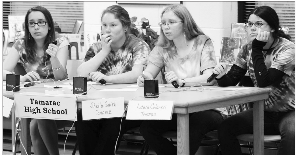
Tamarac High School students participate in a Masterminds competition, testing their knowledge of history, geography and other facts.

This year, the district consolidated bus routes, saving 250 miles a day for school buses that average 8 miles to the gallon. The district saves approximately $82,000 a school year. Bus runs have been reduced from 57 bus runs last year to 44 bus runs this year.