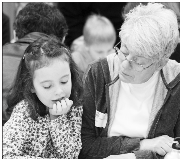
A Tamarac Elementary student shows off her reading skills for her grandmother during this year's Grandparents and Special Friends Day.

For further information, please call the District Clerk's Office at 279-4600 ext. 2604.